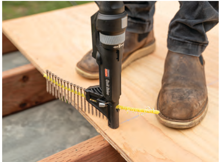
Quik Drive Project Pro and collated screws from Simpson Strong-Tie, the leader in structural and project fastening.